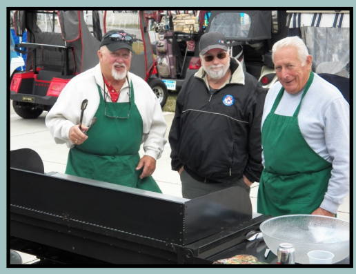
The Men's Group serving up Brats & Dogs!