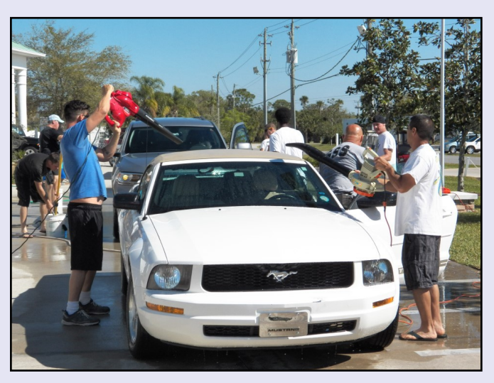
Cars, trucks and golf carts will be washed for a love donation

Following the program, the men from Liberty Lodge will assist the Breakfast group with the Annual Car Wash.