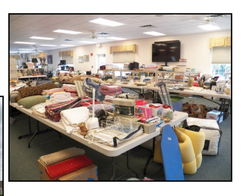
Lots of goodies were sold that day!