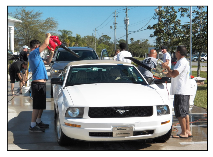
Cars, trucks and golf carts will be washed for a love donation

DONATIONS WILL BE GIVEN TO LOCAL CHARITIES