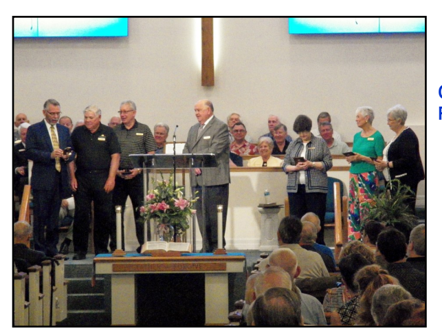
Outgoing Board Recognition