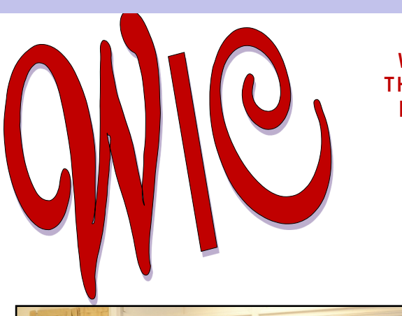
WOMEN IN THE CHURCH Luncheon Feb 12