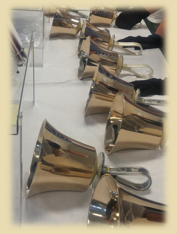
GOCC "Bells of Praise"