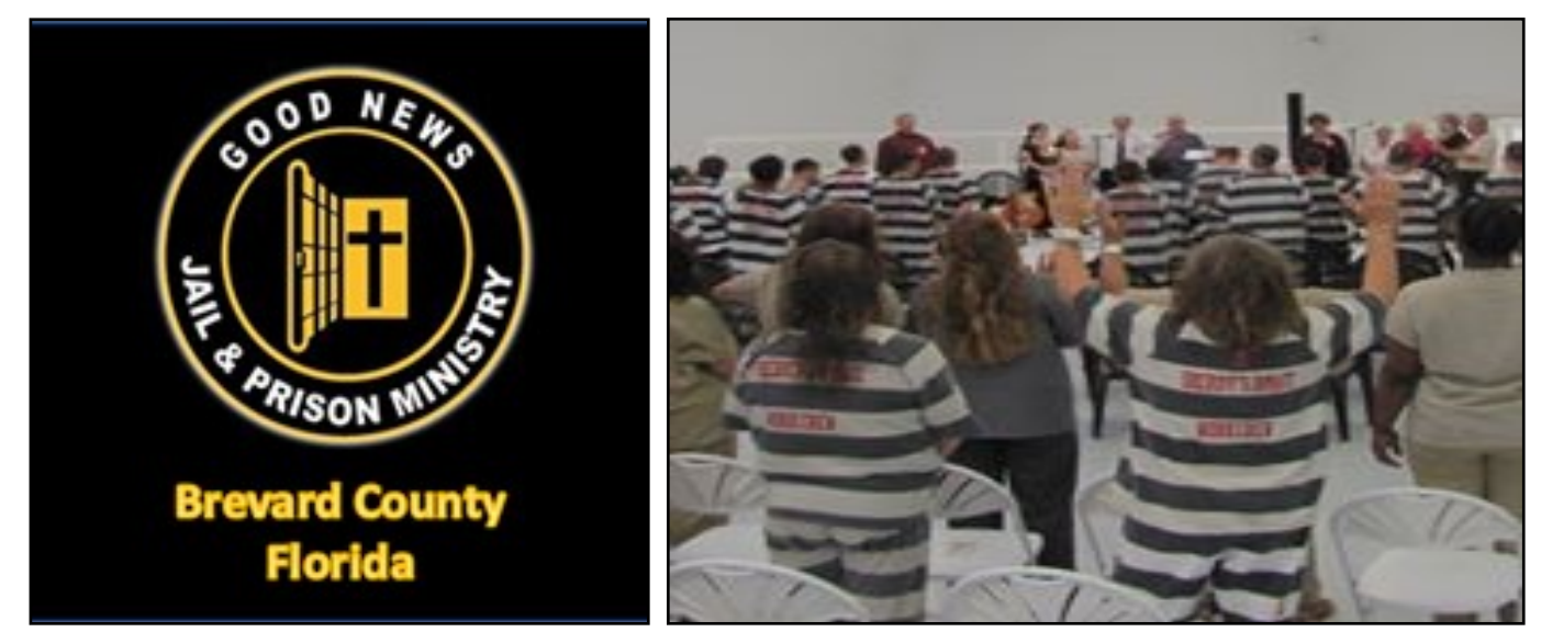
Mending the Brokenness

Sharing the Good News of Jesus Christ changes lives behind bars and gives hope for the future.