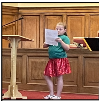
This young girl delivered 70+ boxes!

Operation Christmas Child is an Evangelistic Mission (not a charity mission), spreading the gospel with a simple shoebox!