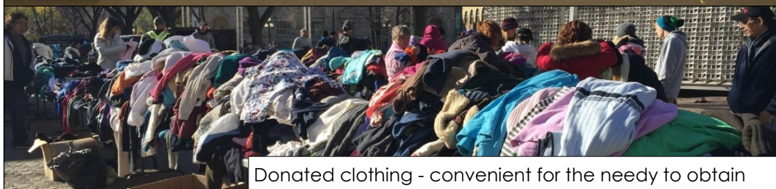
Donated clothing - convenient for the needy to obtain

Please keep your contributions coming - and MAY GOD BLESS ALL OF YOU!