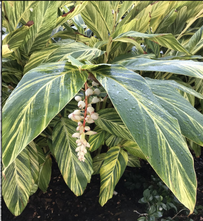
Ginger - Ever expanding