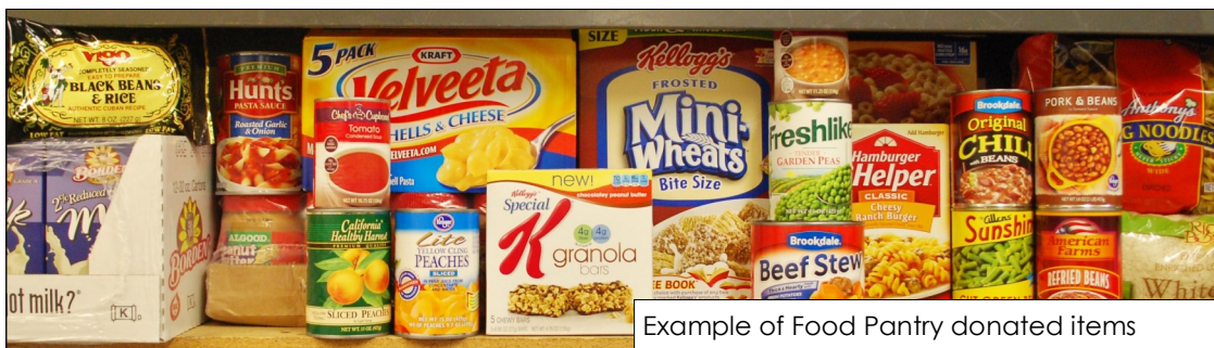
Example of Food Pantry donated items

A big need! Before disposing of your out-of-date, too big, too small items, please consider giving them a "second life" - donate them to help Walk About Ministries