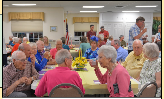
Post concert - Gathering for fellowship and treats

APRIL 2 GOCC Easter Musical Featuring GOCC Choir and Bells of Praise