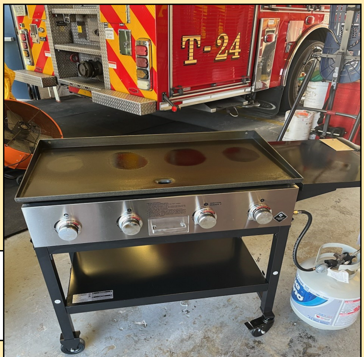
“What’s Cookin’ at Station 24?”