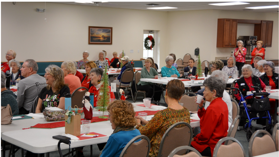
WIC Luncheon attendees