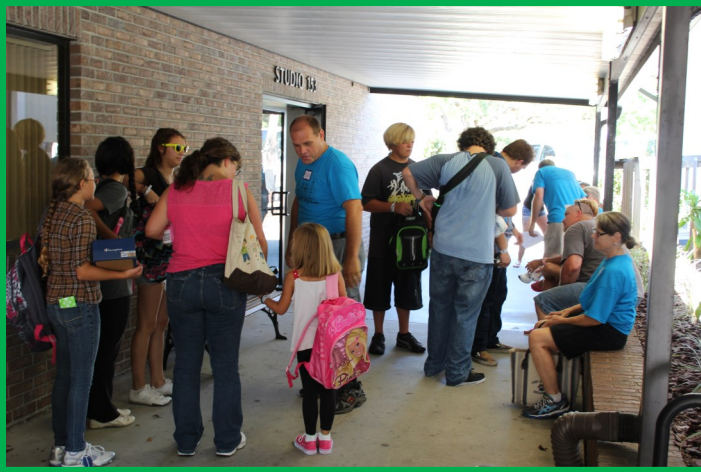
Greeters and Guides