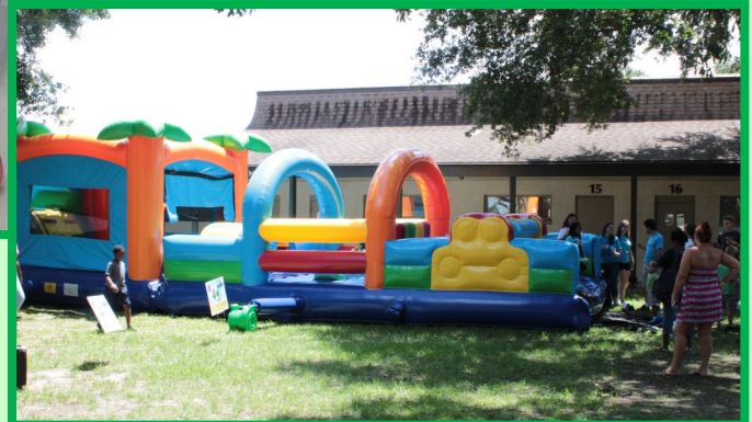
The Obstacle Course

As long as there are tests in school, there will be prayer in schools.