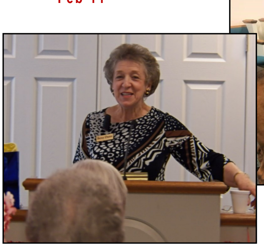
Devotion "Attitude of Gratitude: Experiencing the Treetops" By: Betsy Dunn