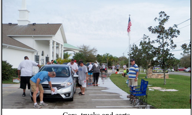
Cars, trucks and carts

Your donations will be used to help local missions