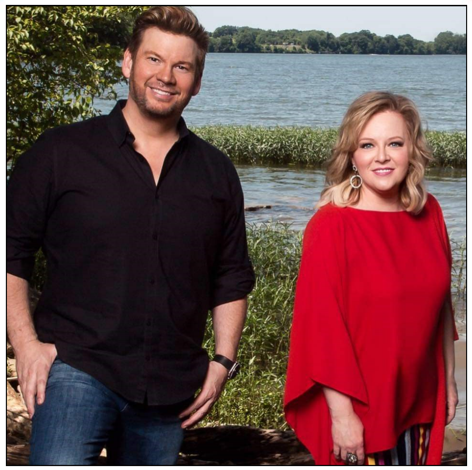
Great Outdoors Community Church 144 Plantation Drive, Titusville, FL Sunday, March 8, 2020 6:00 pm

Love Offering Will Be Received 321-385-9731 or 321-383-9437 TGOchurch.org