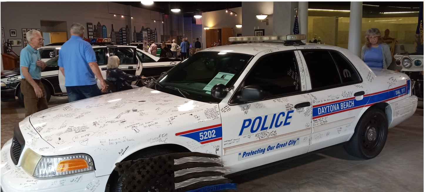
A lot of great exhibits and very informative docents who accompanied group throughout the museum. A very worthwhile outing for the Singulars group.