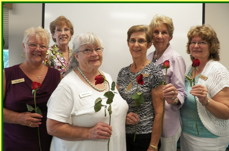
New Board Members (left to right)