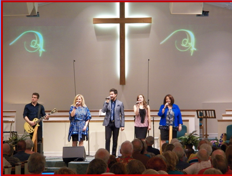
Karen Peck & New River (April 6, 2014)