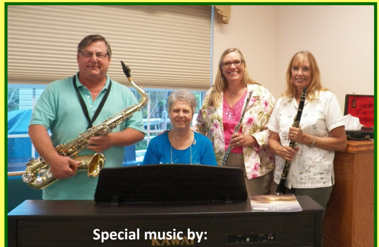
Special music by: