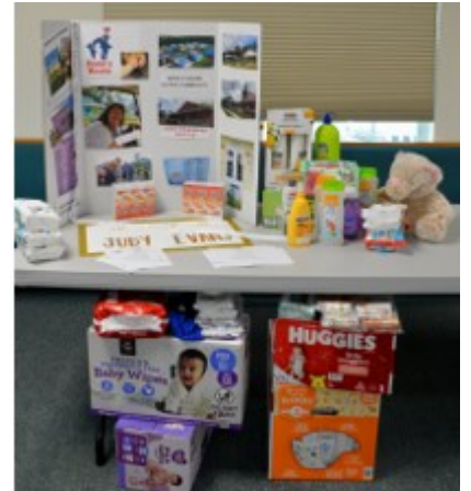
Nana's House display. (Monthly Donations accepted.)