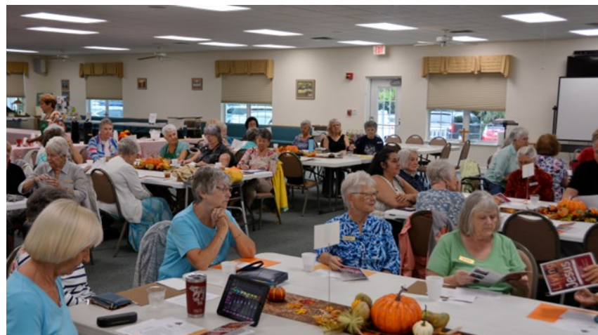
WIC Group Attendees