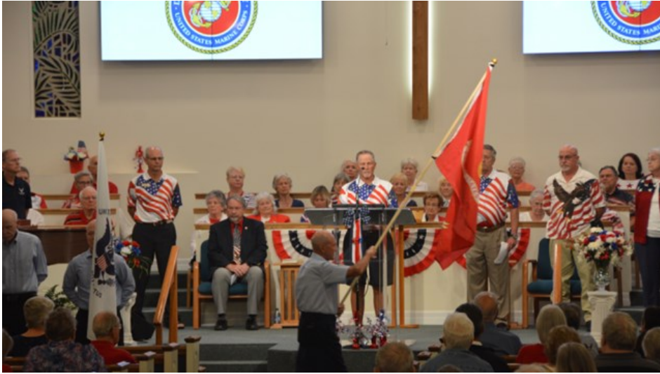
Marine Flag and all Speakers